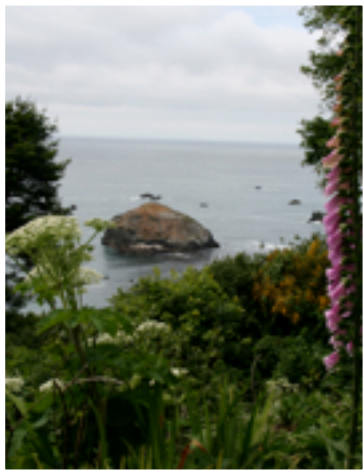
Beauty and Braun at The Lost Whale Inn